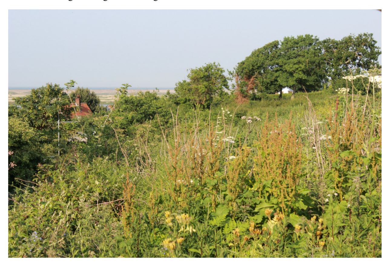
Photograph 1. View to the east, level with the west end of North Landing showing the dense rank vegetation which could be replaced by gorse. The trees at the back are not in the parish land