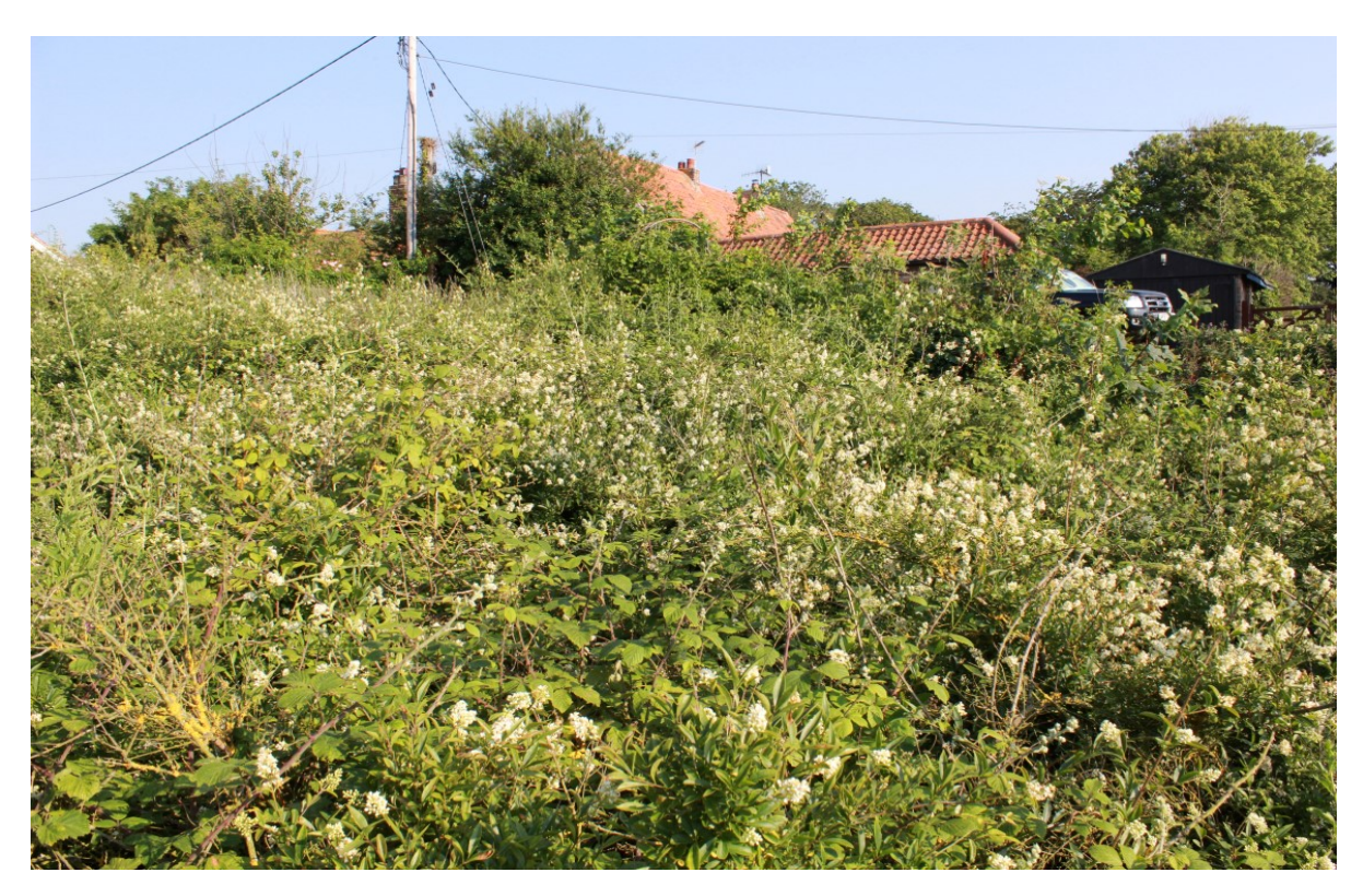
Photograph 4 Looking South to Hilltop in 2013 at area of vegetation which is mainly wild privet and which needs to be thinned out to create more edge. Photograph 5 below shows view in 2019 with some planted gorse and the access route to Hilltop.