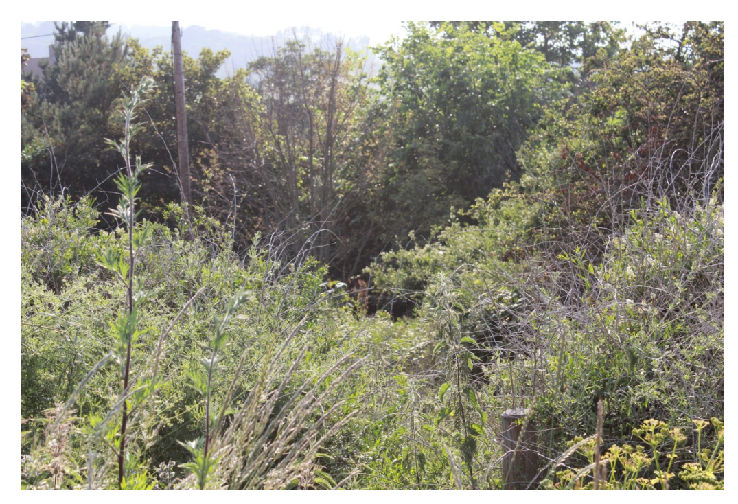
Photograph 2. View in 2013 to the west from the west end of North Landing showing the area which needs to be thinned out to create more edge and where the access route G is planned. The line of Sycamores is just outside the left hand side of the picture. The dying Sycamore is to the right of the telegraph pole. Photograph 3 below shows the same view in 2019 after the access route was completed.