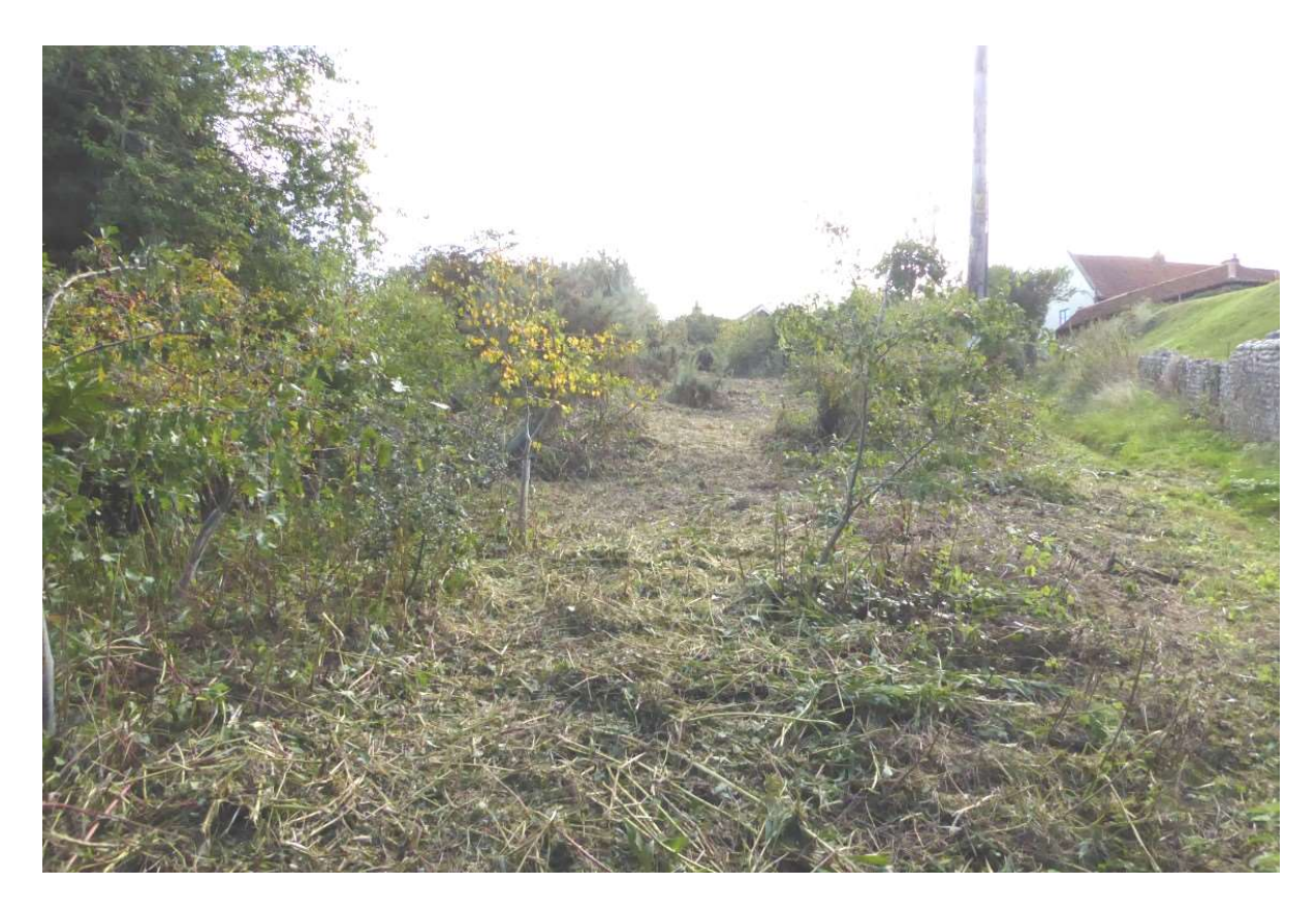
Photograph 6 Looking East in 2019 from the Western edge of the management area showing the area thinned, which also serves as an access route through part of the area